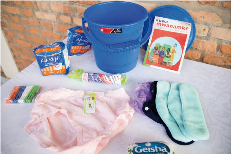
Items included in MHM kit B (reusable/washable pads) distributed in Bwagiriza refugee camp; Burundi, 2013.