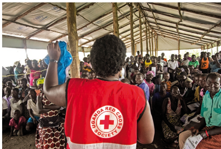
A Uganda Red Cross volunteer demonstrates how to use and care for reusable sanitary pads during the distribution of MHM kits; Impevi refugee settlement, Uganda, 2017.

Ensure that information on what is going to be distributed, to whom, when, why, and how the distribution process will work is communicated before, during, and after the actual distribution. Some 'consumable' items are quickly used up, such as soap and disposable pads. It is very important to be clear and up-front