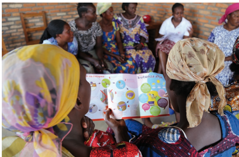
Women read the information brochure (included in each MHM kit) during a focus group discussion in Bwagariza refugee camp; Burundi, 2013.